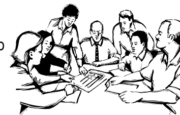
CHURCH PLANNING MEETING