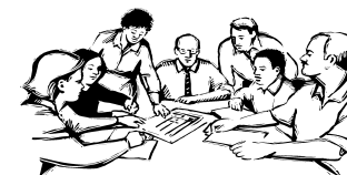
CHURCH PLANNING MEETING