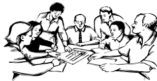
CHURCH PLANNING MEETING