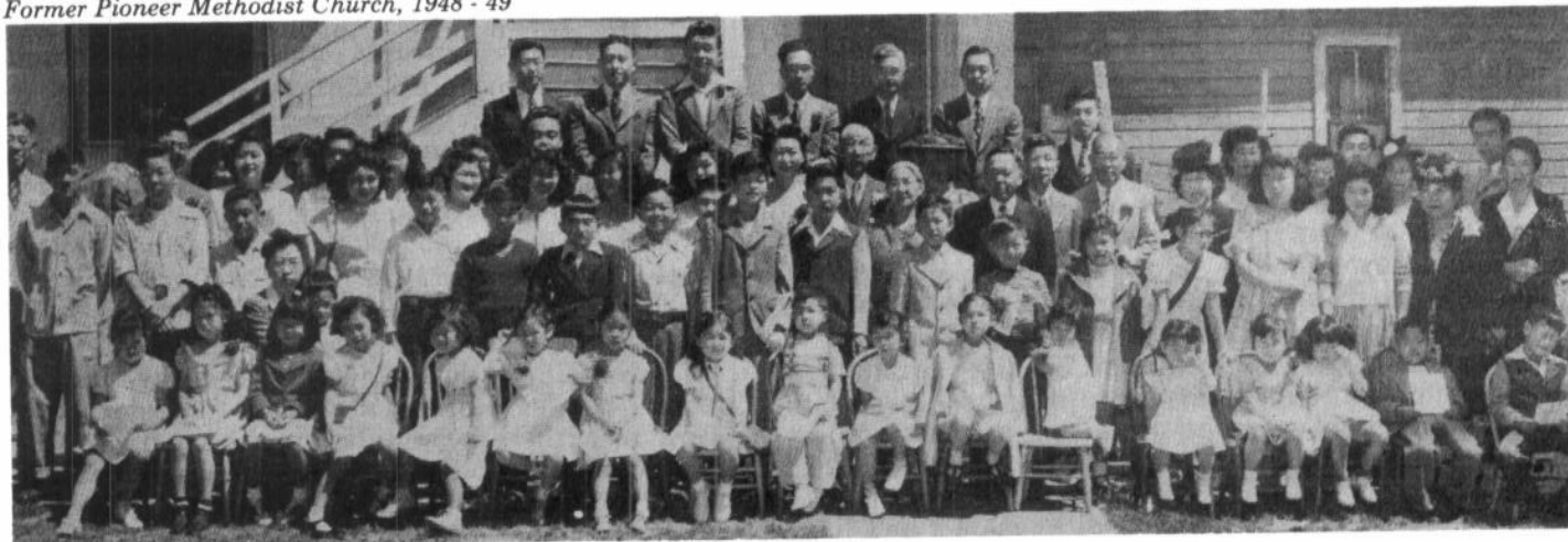
Former Pioneer Methodist Church, 1948 - 49

The history of the Pioneer Methodist Church and the Florin Japanese Methodist Church makes fascinating reading, however, the merger of these two historic churches into one and its continual existence with its hopes and mission is one of the finest pages in its ongoing history.